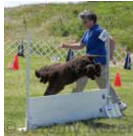
Ch. Kimswick's Sweet Memories, CD, RN and the author competing in Rally Advanced class